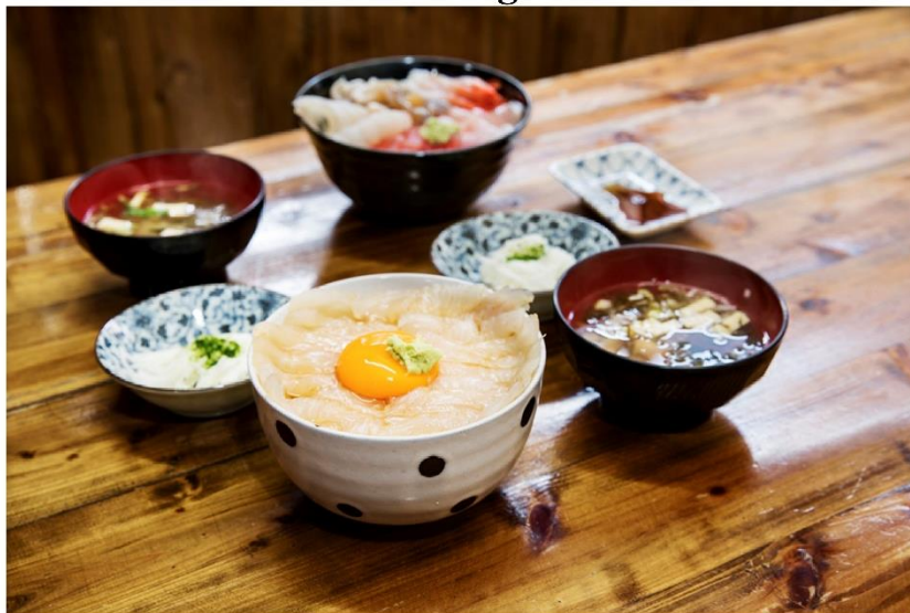
(Hirame Zuke-Don by Minato Shokudo)

Japanese summers are famous for being very hot, watch any Japanese TV show and you'll see cicadas chirping, long grass standing still with no wind to ruffle them and lazy humid afternoons. But the Summer months are where the north of Japan is at its best. The regions of Tohoku and Hokkaido still provide a beautiful hot summer, but with their wide open green spaces are much cooler than the bustling and sweltering big cities of Tokyo, Osaka or Nagoya. Escape air conditioned hotels and restaurants, and explore a wonderful variety of nature. All the way through Summer and Autumn, you can travel to the north of Japan and beat the heat.