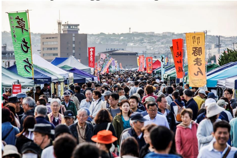
(The Morning Market at Tatehana Wharf)

If you are looking to pick up a bite to eat in the city, visit Hachinohe's incredible Sunday morning market – the largest morning market in Japan with over 300 vendors across over 800 meters! Pick up fresh seafood, local fruit and vegetables, and also ramen, pizza and fresh baked goods. The local Aomori area is famous for huge apple orchards so make sure you pick up some to try yourself. The market offers a wide variety of foods that you can snack on while you take a leisurely walk around the market. Favourites include grilled fish, and local seafood called hoyo or “Sea Pineapple”.