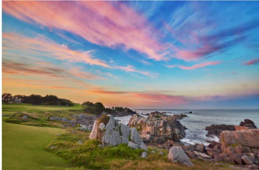
(The Michinoku Coastal Trail)

Once you have experienced the excitement of Hachinohe City, experience pristine nature as you hike on the Michinoku Coastal Trail . The full trail runs 1,000km all the way down to Soma City in Fukushima Prefecture, any point on the trail will showcase the incredible Japanese coast, including beaches, cliffs, forests, mountains, and shrines.