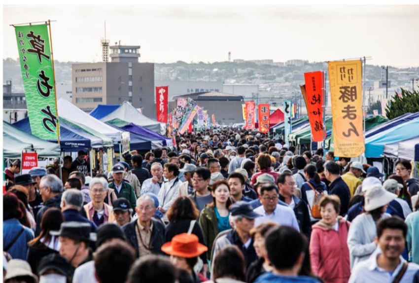
( Tatehana Warf )

If you would prefer to take it easy and live like a real Hachinohe citizen, join them at the Tatehana Wharf for the biggest morning market in Japan. Every Sunday thousands of locals gather to enjoy fresh local food and produce, from fruit and vegetables to seafood fresh from the Hachinohe fishermen's catch. The market is not only famous for its food, there are stall selling antiques, traditional crafts, and all sorts of locally produced goods. If you want an authentic Japanese experience, join the crowd here, eat some local delicacies and browse the stalls.